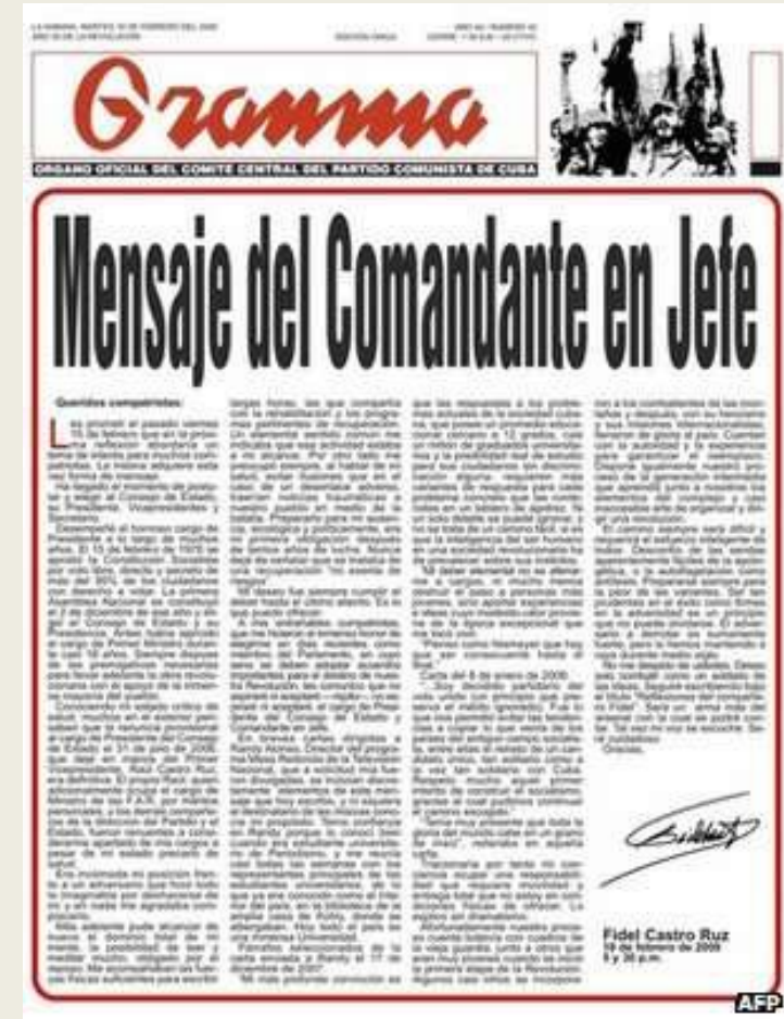
Granma, one of the only newspapers, handled by the government