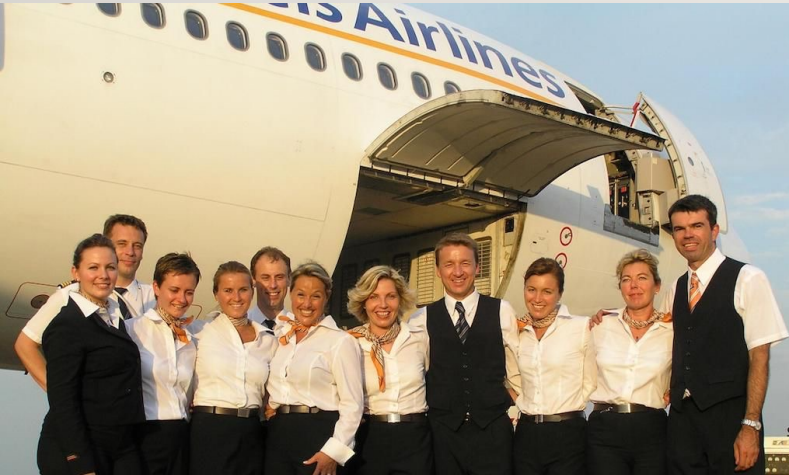
Employee's benefit. (Internal benefit)

Benefit The diagram consists of two large, thick, magenta arrows pointing towards each other, framing the word 'Benefit'. The arrow on the left points right, and the arrow on the right points left.