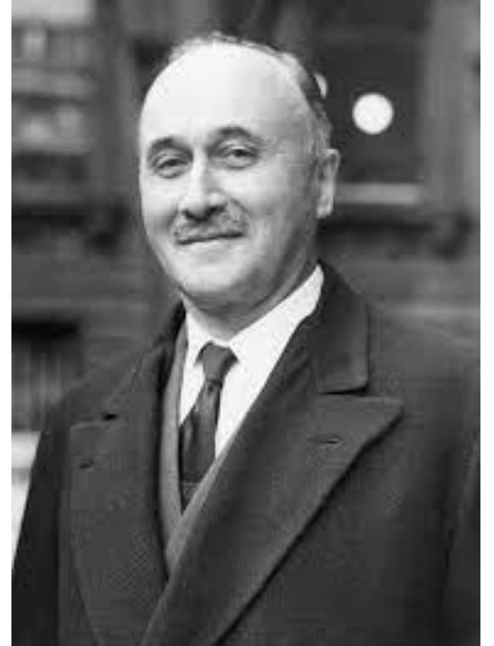
Jean Monnet, former french politician, "father of Europe"