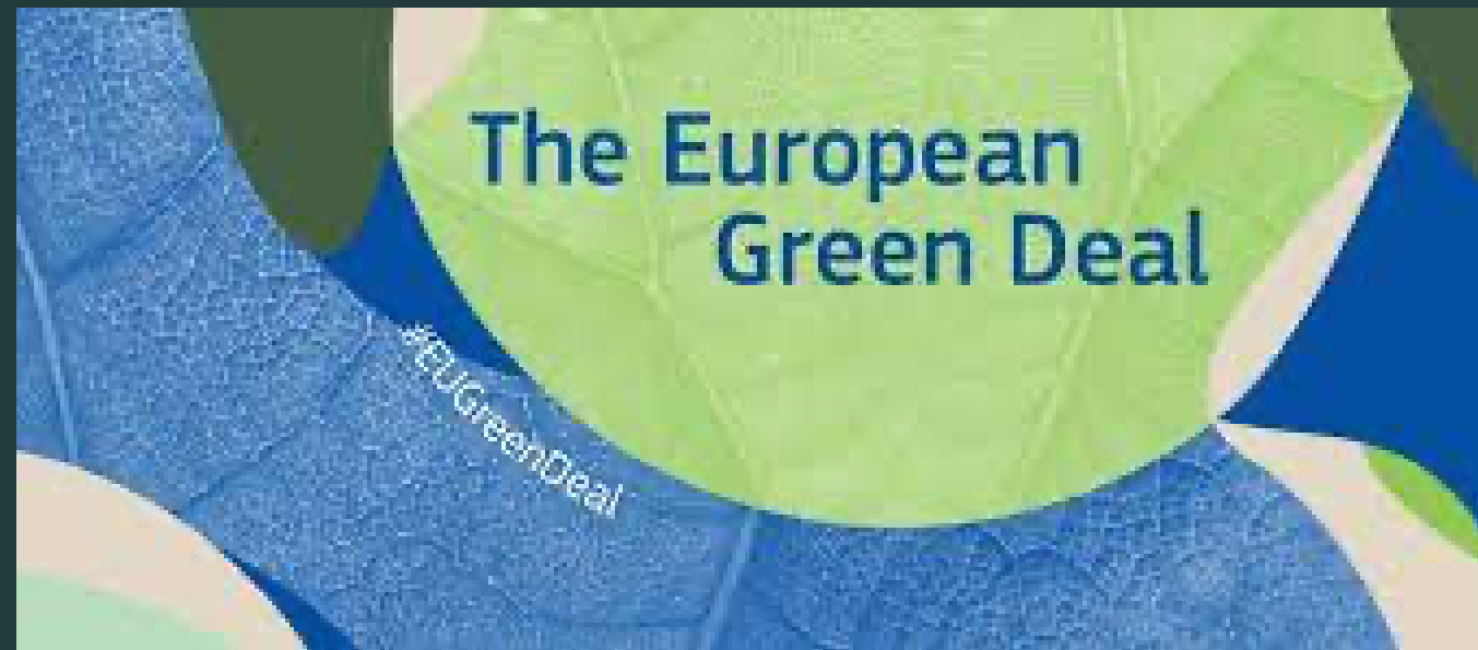
European Green Deal